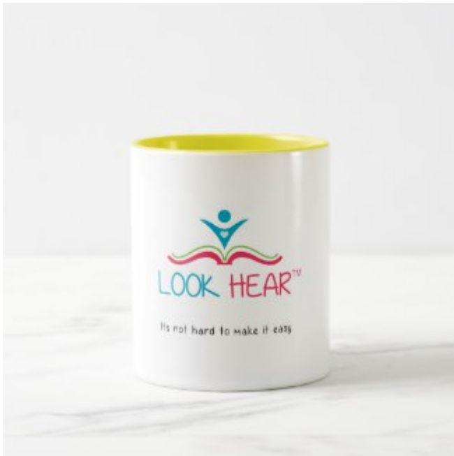
Look Hear – Mug by LookHearAustralia