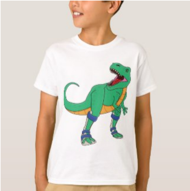
Dino AF0 Kids T