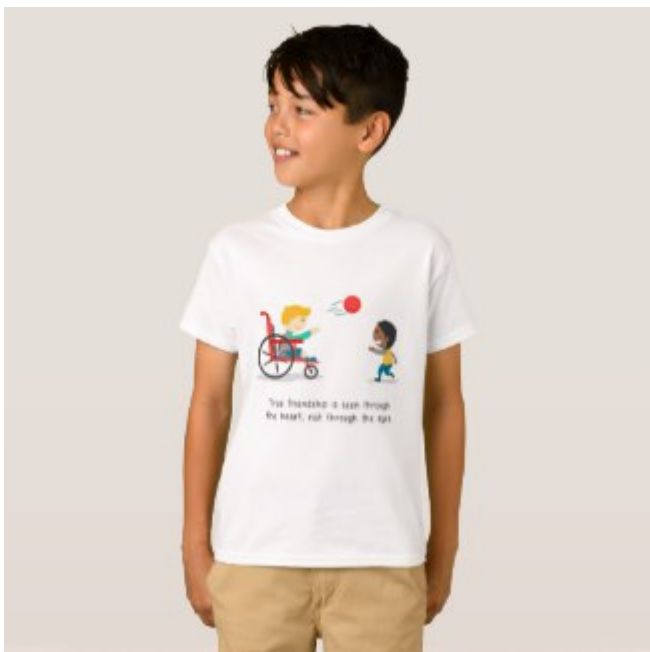
True friendship T-Shirt