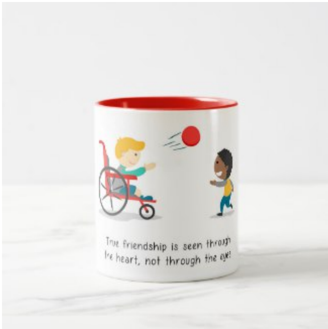
True friendships Two-Tone coffee mug