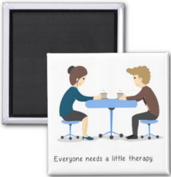
Everyone needs a little therapy – Magnet by LookHearAustralia