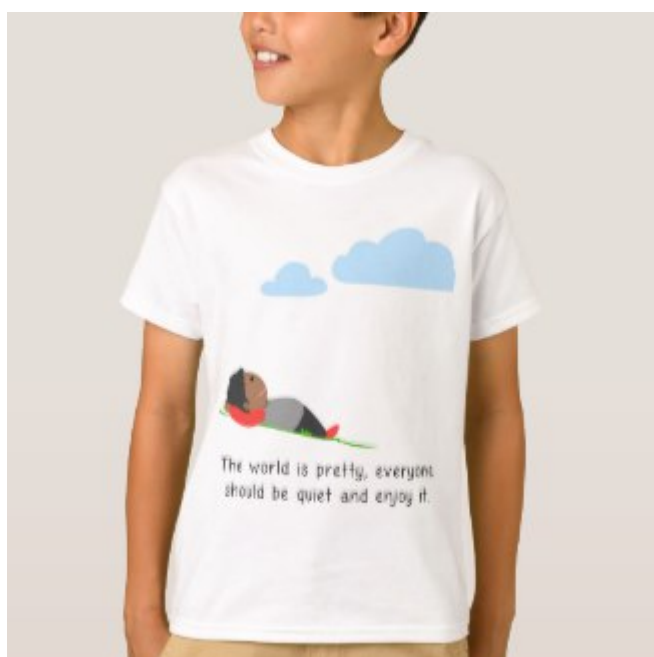
The world is pretty T-Shirt