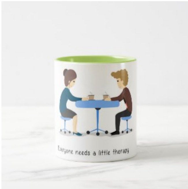
Everyone needs a little therapy – Mug by LookHearAustralia