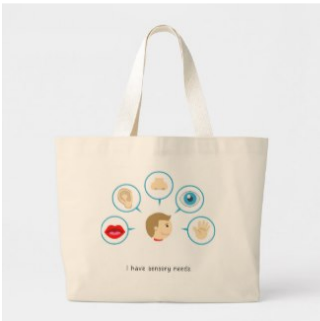
I have sensory needs – Tote