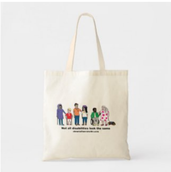
Not All Disabilities Look the Same Budget Tote Bag