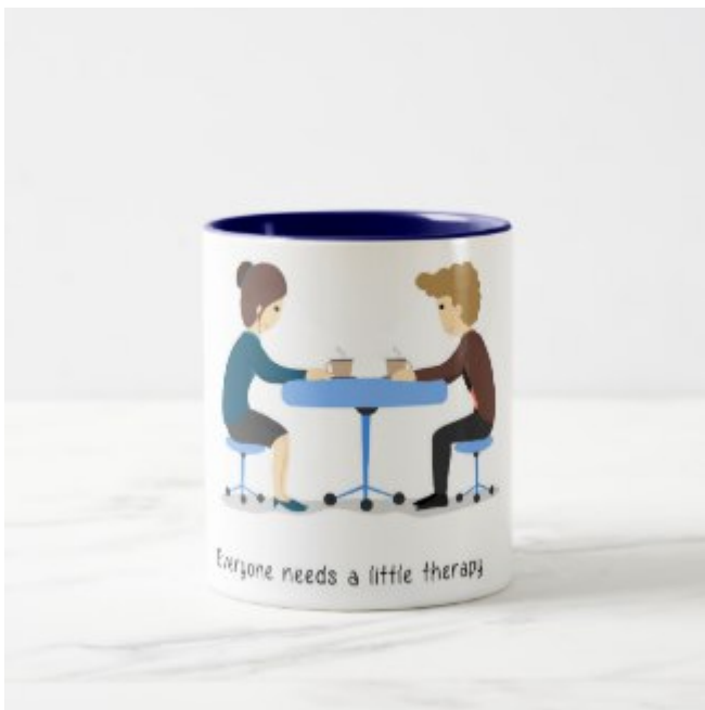
Everyone needs a little therapy – mug by LookHearAustralia