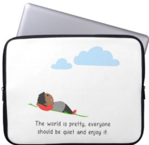
The world is pretty laptop sleeve