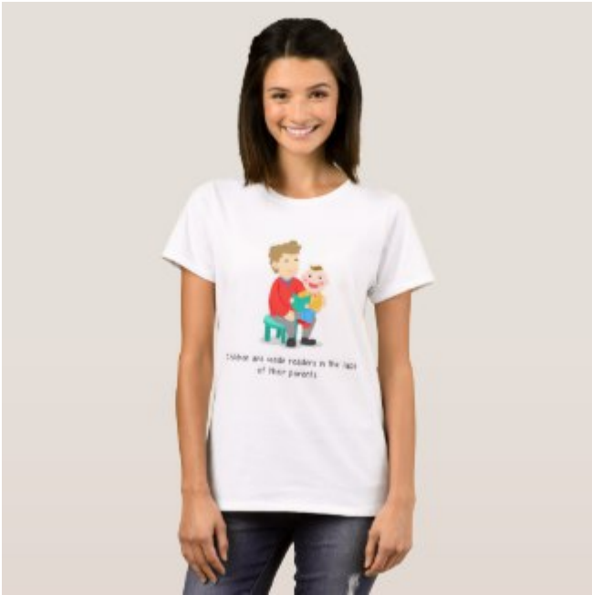
Children are made readers – TShirt by LookHearAustralia