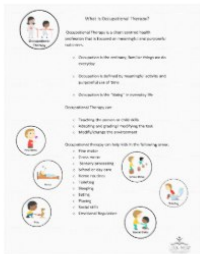
Occupational Therapy -Canvas by LookHearAustralia