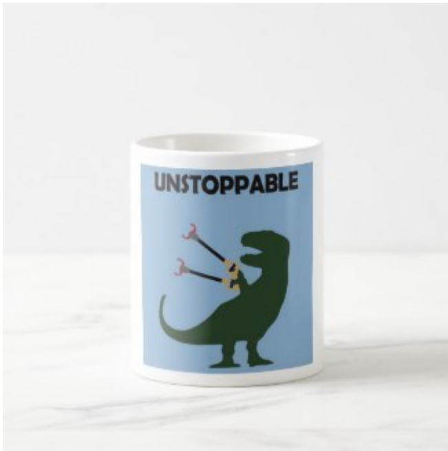
Occupational Therapy OT Grabber Reacher Mug by UrgentDogsPBC