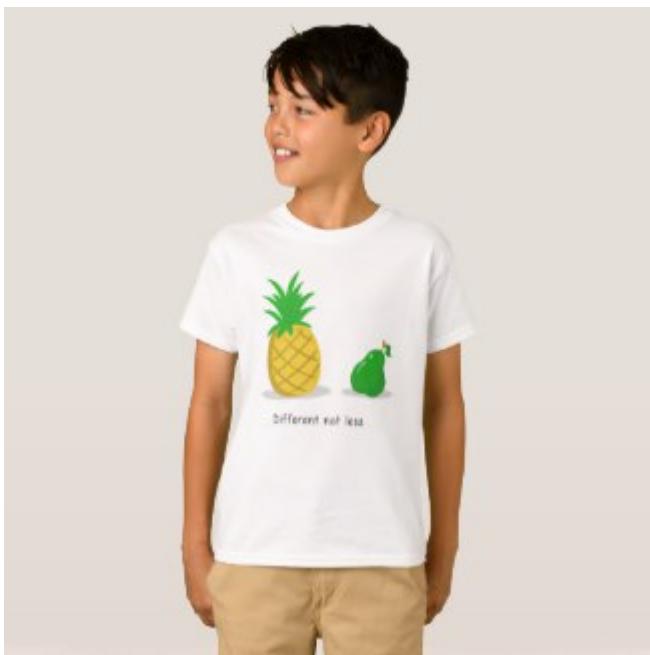
Different Not Less – Children's Shirt by LookHearAustralia