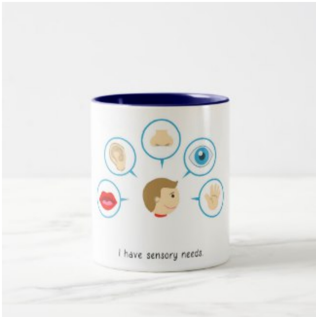
I Have Sensory Needs – Mug (Navy)