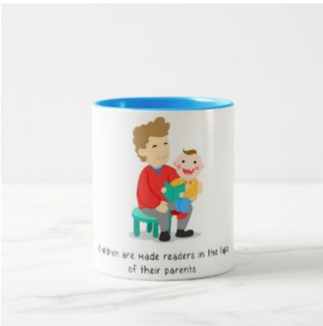
Children are made readers Two-Tone coffee mug